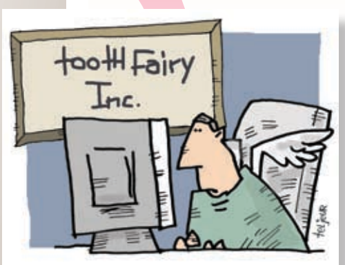
Thirty seven teeth from the <u>same</u> kid? We've been had.