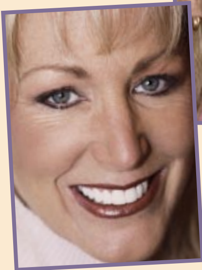
Modern crowns & veneers turn a smile into ... a SMILE!

And the bonus: avoid the premature wrinkles and age lines that may accompany an altered bite. Your smile will look even more attractive!