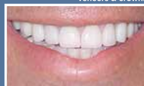
22 porcelain veneers & crowns