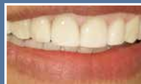
6 porcelain veneers